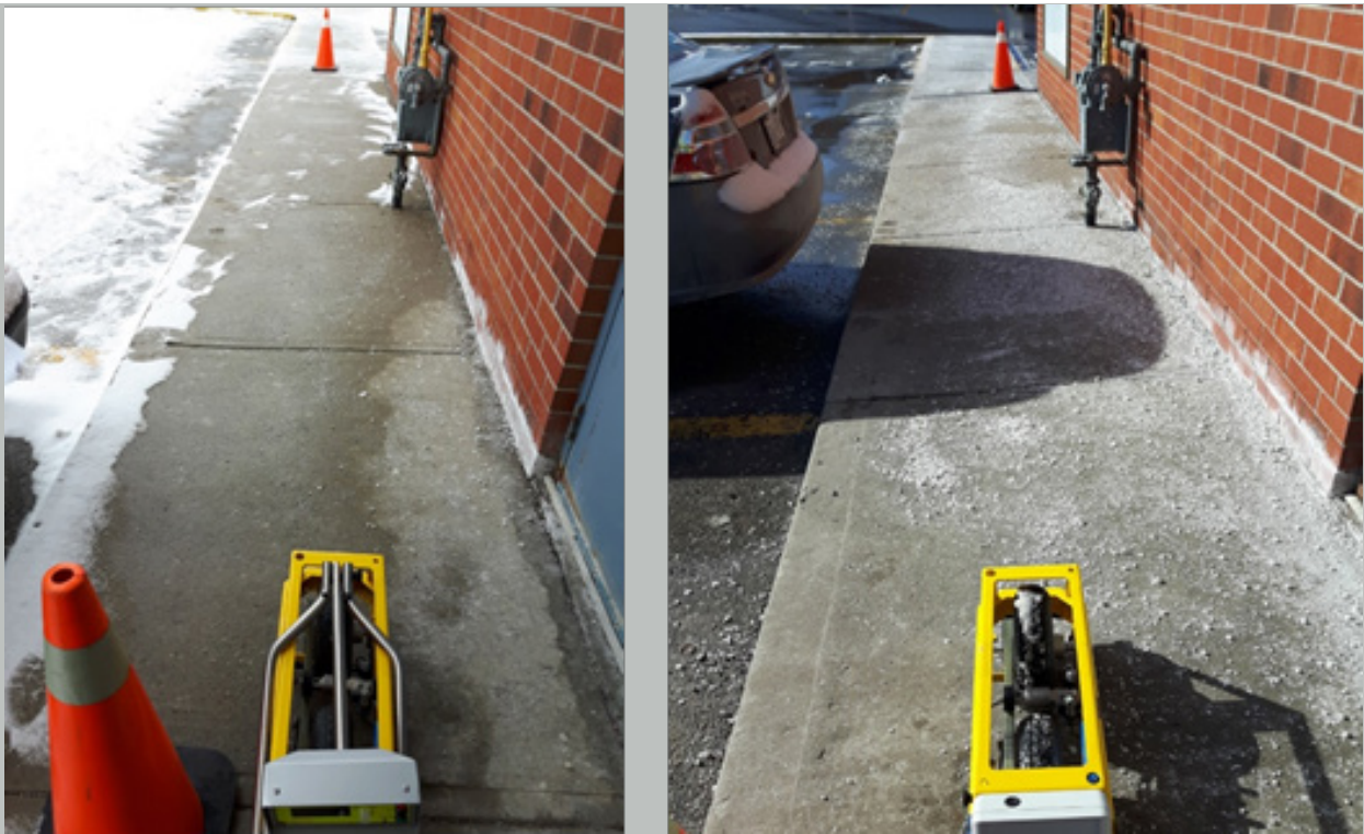
Figure 2: Friction values for a properly treated surface \mu = 0.63 (left image) and an oversalted surface \mu = 0.26 (right image)

Through this work, LSRCA staff were also able to demonstrate that while excessively high volumes of salt are no safer than many untreated surfaces, the \mu value of a surface may still remain low if it has only been shoveled or plowed. Figure 3 displays a walkway where more than 10 times the generally recommended amount of salt was applied in the photo on the left, and only shoveling was done in the photo on the right, and both \mu values were in the low 0.20s. This demonstrates that while shoveling is an important part of the winter maintenance process, practitioners need to consider the site and predicted conditions on the day to determine how to attain the safest surface. In many cases the sun or traffic may melt the residual snow on a shoveled or plowed surface without any further treatment being necessary; while in other cases, some salt, applied at an appropriate rate, may be necessary.