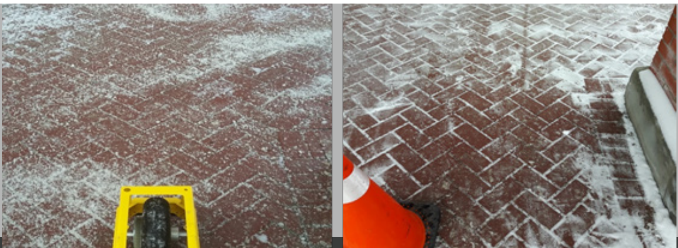
Figure 3: Similar \mu values were measured for an oversalted walkway (left image), and the same walkway which has had the snow shoveled off (right image).

This work highlights the importance of considering all factors, including vehicle use, and current and anticipated weather, to ensure that the management of the parking lot does not contribute to collisions. Pavement treated with an appropriate amount of salt is almost as safe as bare pavement; this should remain the goal for winter maintenance contractors.