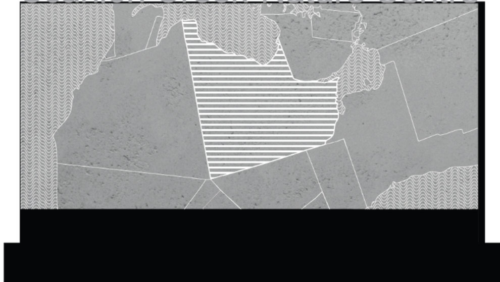
East Feature Wall treaties map - Lake Simcoe-Nottawasaga Treaty No. 18