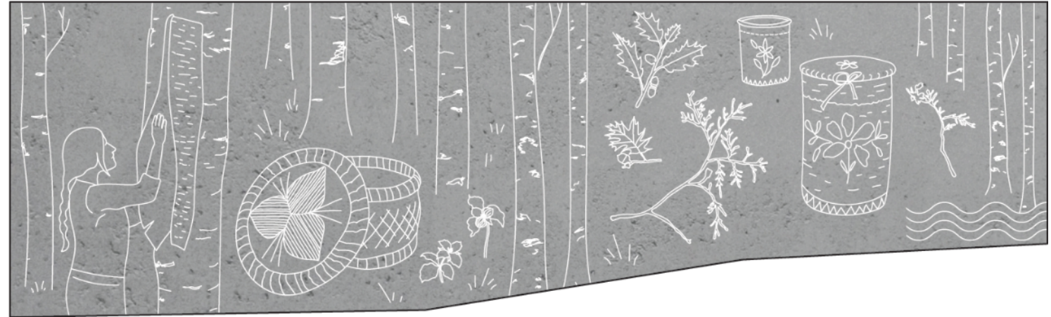
West Concrete Wall harvesting, birch